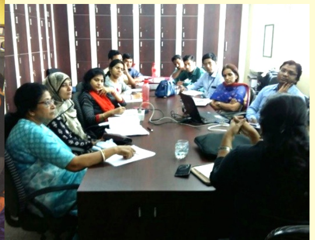
Refurbished Staff Room