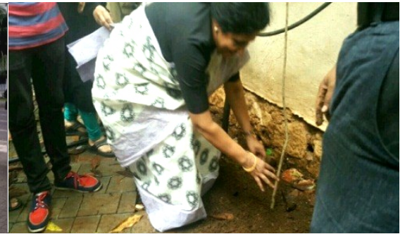
Tree Plantation in college area (1st July, 2016)