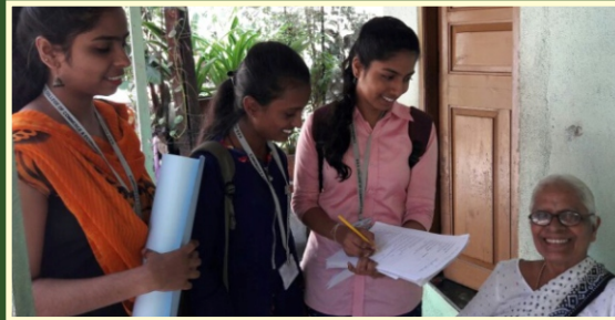
Survey on solid waste management September-October 2016