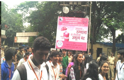
Organ Donation Rally on 02/10/2016