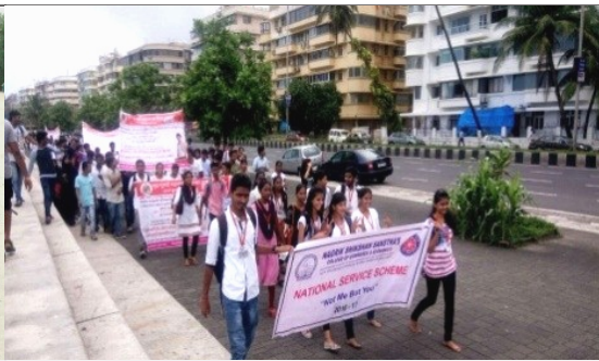
Rashtriya Ekta Diwas - 'Run for Unity' Rally on 31/10/2016