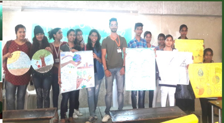
Poster making Competition on Environment Conservation (29th November 2016)