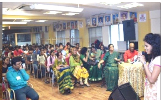
Singing competition - Independence 70 on 9th August to 23rd August 2016