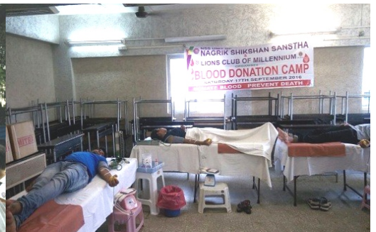
RRC Blood Donation Camp 18th September 2016