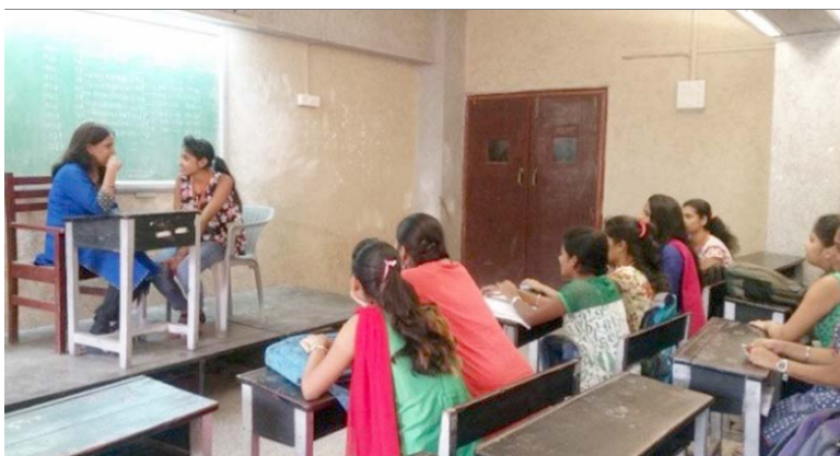
Mentor Tutor Scheme, initiated by the IQAC. Each mentor addresses to personal, academic, psychological and other issues of the students and counsels them by giving personal attention