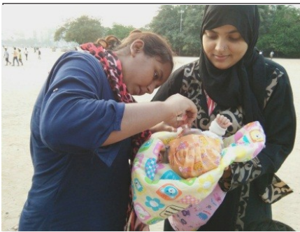
Pulse Polio Drive in the month of 25/09/2016 to 30/09/2016