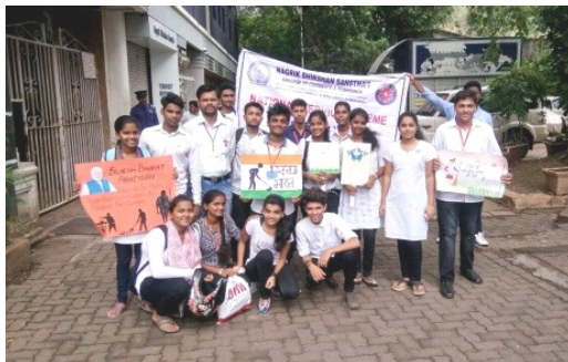
Swachh Bharat Abhiyan on 22/08/2016