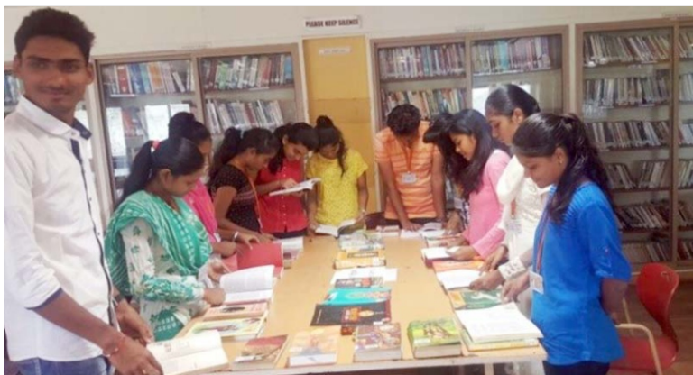
National Education Day - Book Exhibition was organised on 11th November, 2016 to pay tribute to great freedom fighter Maulana Abdul Kalam Azad.