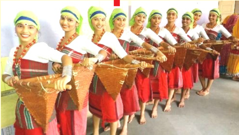
Award Winning Dance in Youth Festival