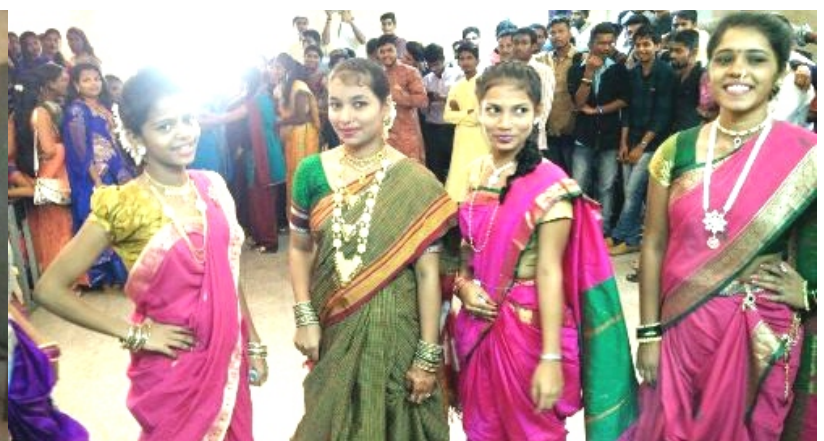
Traditional Day on 22nd December 2016 and Saree day on 24th December 2016

For my parents' generation, the idea was not that marriage was about some kind of idealized, romantic love; it was a partnership. It's about creating family; it's about creating offspring. Indian culture is essentially much more of a 'we' culture. It's a communal culture where you do what's best for the community - you procreate.-