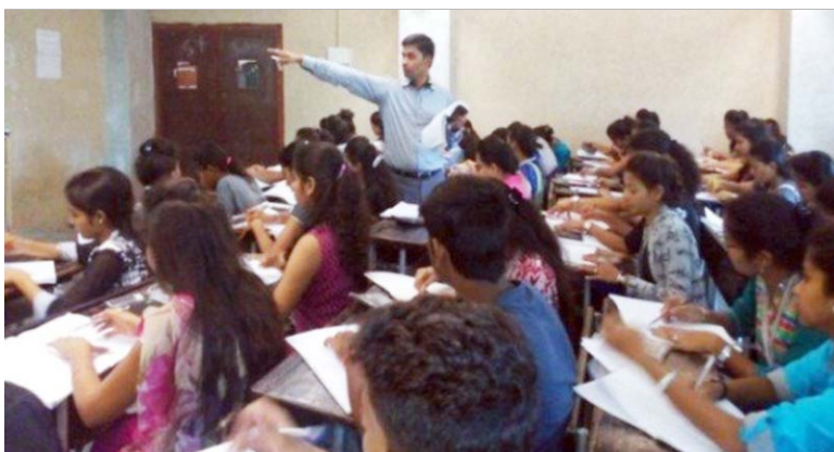
The college has an active Remedial Coaching Cell which was formed under UGC plan Merged scheme. The cell organises remedial lectures for academically weak students to enable them to cope up with other students.