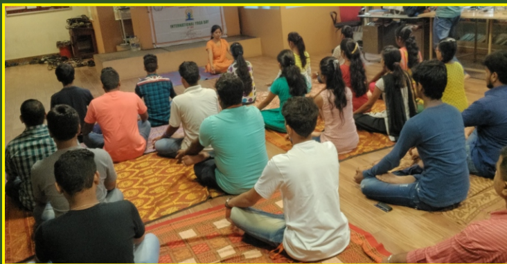
Yoga for Mind Relaxation

Look deep into nature, and then you will understand everything better. -Albert Einstein