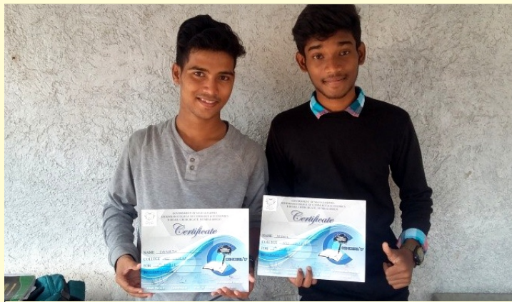
Best Advertise (Intercollegiate Competition) winners