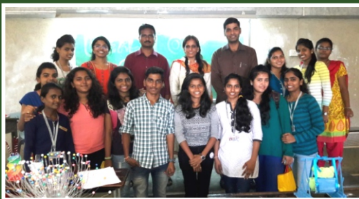
Best out of waste competition' 30th September 2016