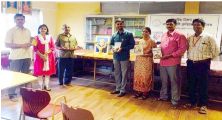
Vachan Prerna Diwas was celebrated on 15th October, 2016 to mark the Birth anniversary of Dr. APJ Abdul Kalam.