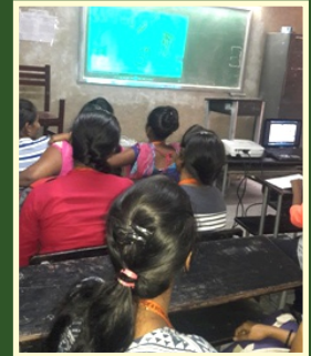
Documentaries on solid waste management November 2016